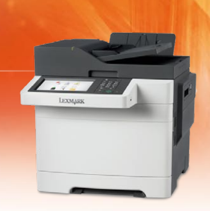
Up to 32 ppm