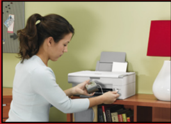
Photo capable with PictBridge compatible digital cameras